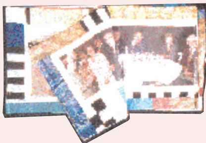
Book made with photo transfers, dress, scarf and blouse fabrics

Please contact us for more information or to discuss customized requests.