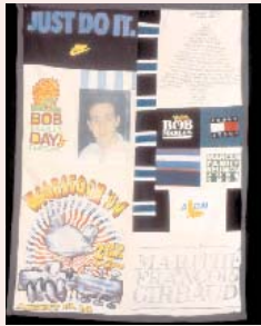
Wall Hanging using boy's suit, t-shirts, and sport shirts

Embellishments such as jewelry, buttons, and pockets add to the design and make each a unique work of art. Photos, prayers, writings and logos can be incorporated into the quilt using a photo transfer method which leaves originals unharmed and returned to you intact.