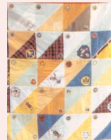
Detail of twin quilt made of boy scout uniforms.

SilkQuilt also produces custom-designed fiber art for organizations, businesses and families. Past commissions have taken advantage of this unique opportunity to —