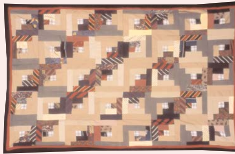
Twin Bed Quilt composed of ties, shirts and pants. Finished with blanket backing.

"Everyone who sees our wall hanging is deeply touched. We loved my father and we miss him. This gives us a way to be with him in spirit."